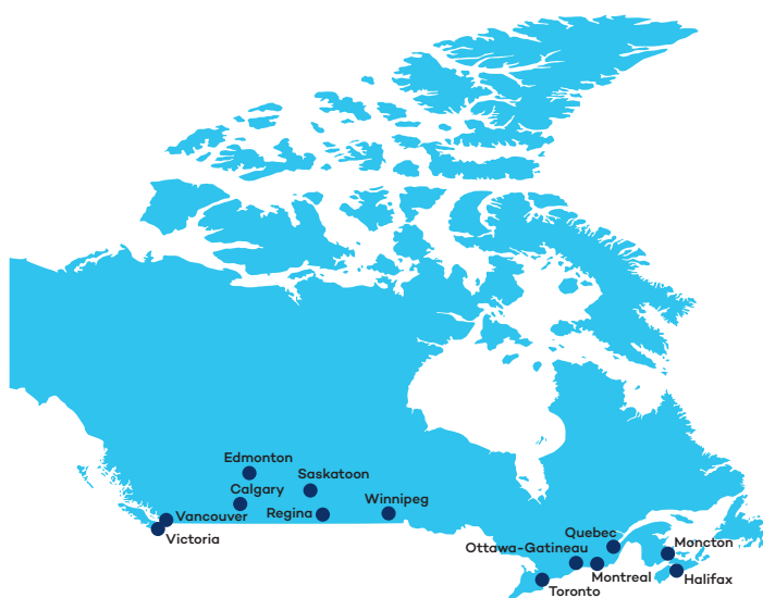
Cities: Halifax, Moncton, Quebec, Montreal, Ottawa-Gatineau, Toronto, Winnipeg, Regina, Saskatoon, Calgary, Edmonton, Vancouver, Victoria

These global indicators provide useful guidance and help facilitate comparability, but they cannot simply be copied over and used at the city level. This is mostly due to the lock-in related to the use of existing indicators and limited data availability for cities. However, developing the methods and capacities needed to report all indicators will take time, while it is urgent that we measure and report on progress now if we are serious about implementing the SDGs. Working with data available in Statistics Canada databases, we identified a set of 12 SDG indicators for 13 cities (Table 1).