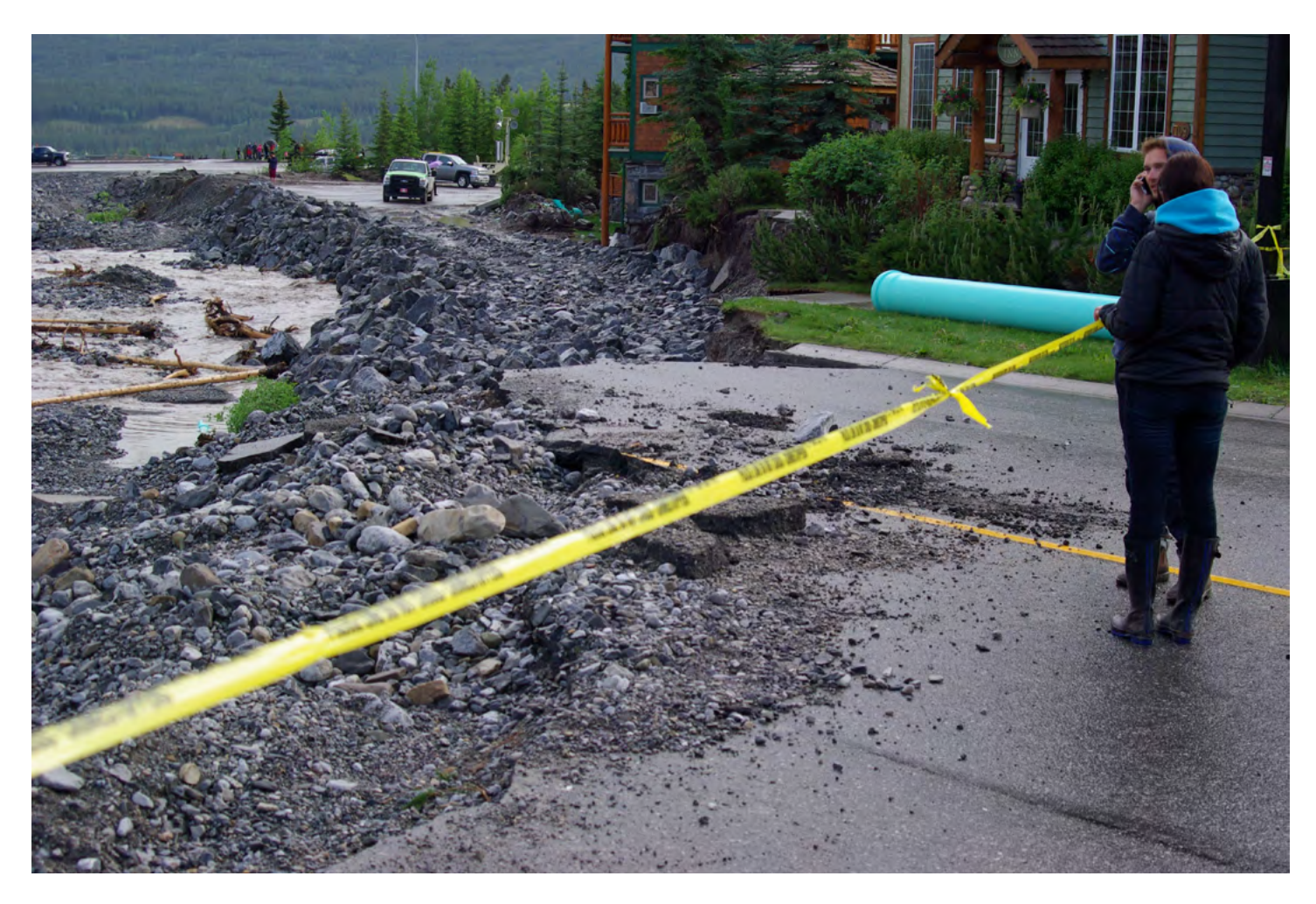
Figure 3. Flood damage in Canmore