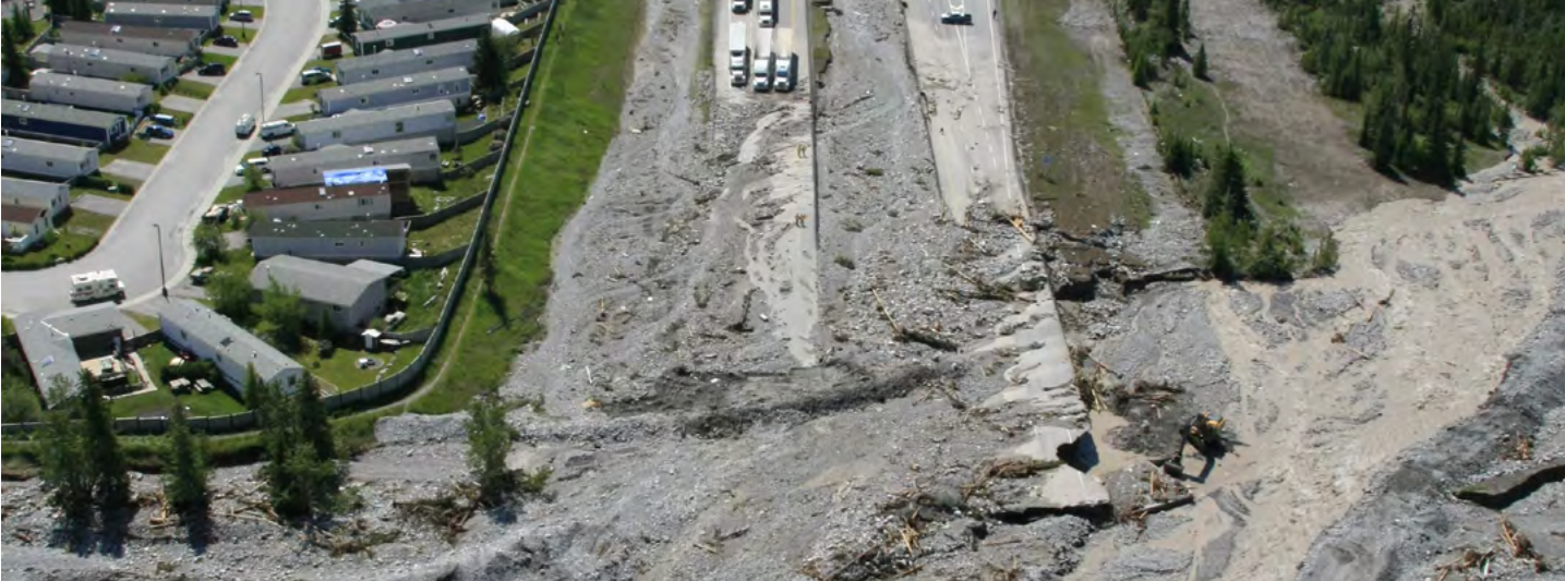
Figure 1. Flood damage in Canmore