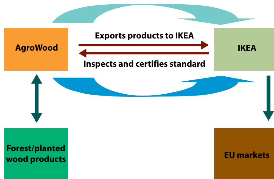
Figure 3: AgroWood's standards and labelling conformity assessment procedures